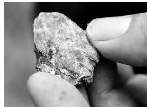
Soldiers Delight's rocky soil — with chromite, asbestos and other minerals in it — provides habitat for 40 rare plants and animals.

ardship, defended the restrictions on wildlands activities and development, but said the state would try to work with those raising questions.