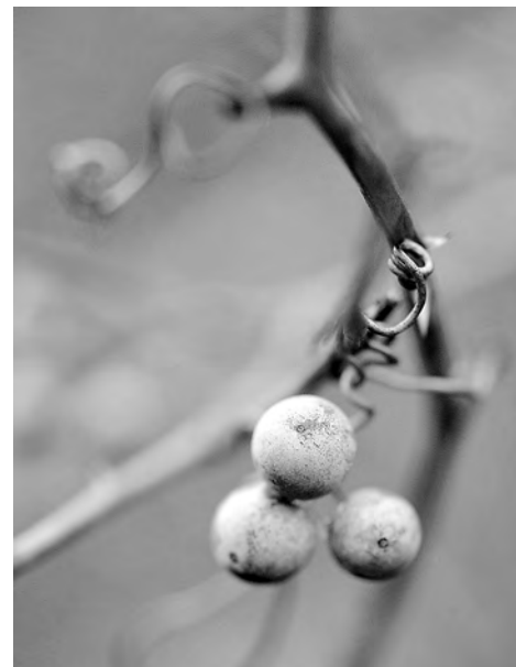
Thorny greenbrier bushes, above, and Virginia pines have overgrown much of the native vegetation at Soldiers Delight.