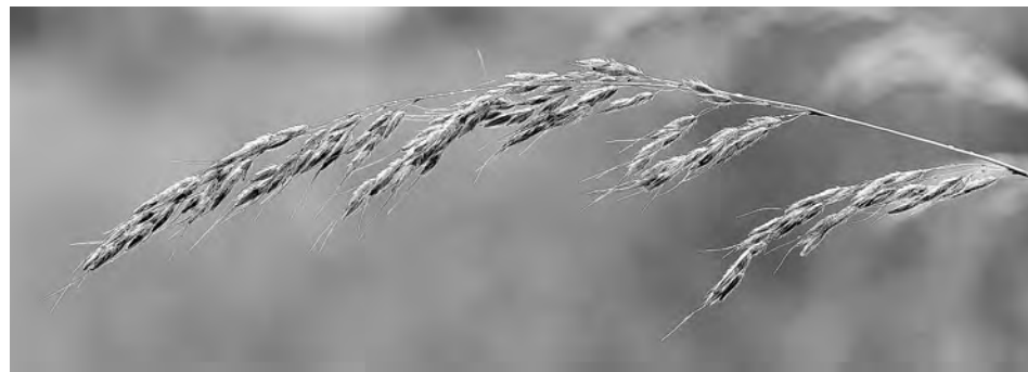
Native Americans set fire to the grass to flush game in the once largely treeless landscape.