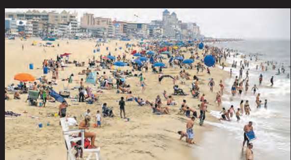
Ocean City beaches, shown in August, are swarmed by recent high school graduates in early June.