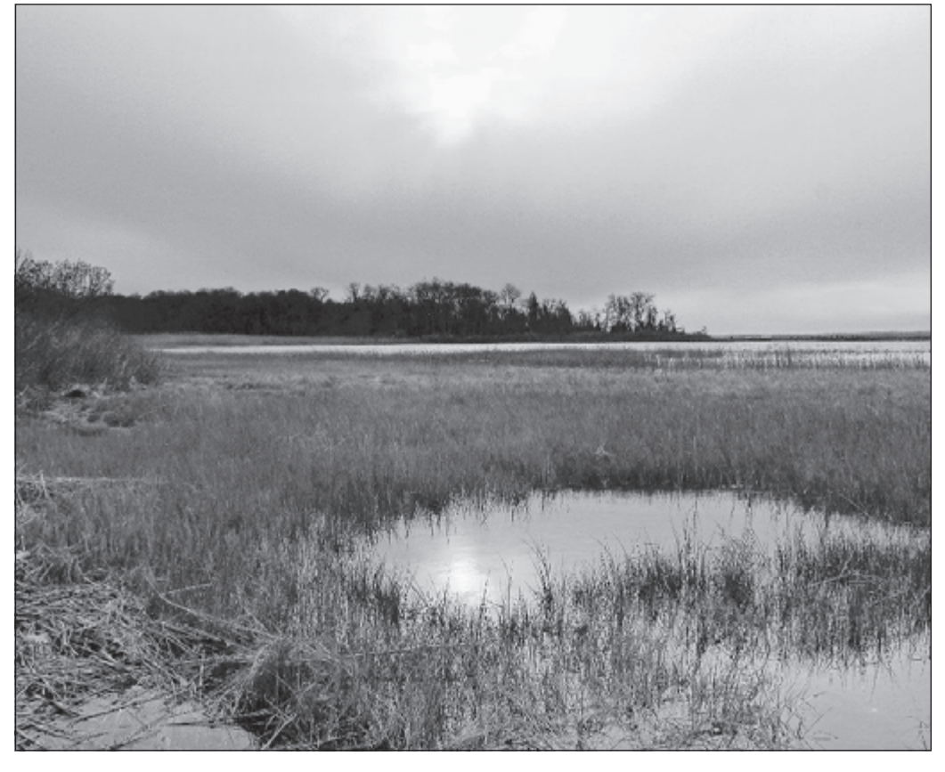
The Narragansett Bay National Estuarine Research Reserve is using a computer program to map the entire coastline of Rhode Island to assess how the mixture of plants in salt marshes is changing as sea levels rise.

- akuffner@providencejournal.com (401) 277-7457