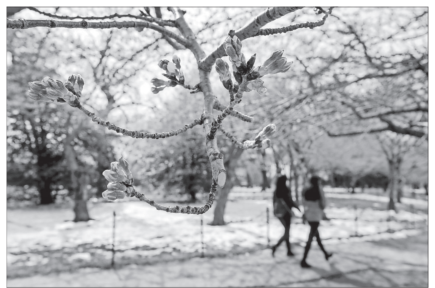
Cherry blossoms peek out along the Tidal Basin in Washington, D.C., on Friday. Wild weather has claimed about half the blossoms in the city, e still expected to put

WASHINGTON, D.C. Cherry blossoms ravaged by weather