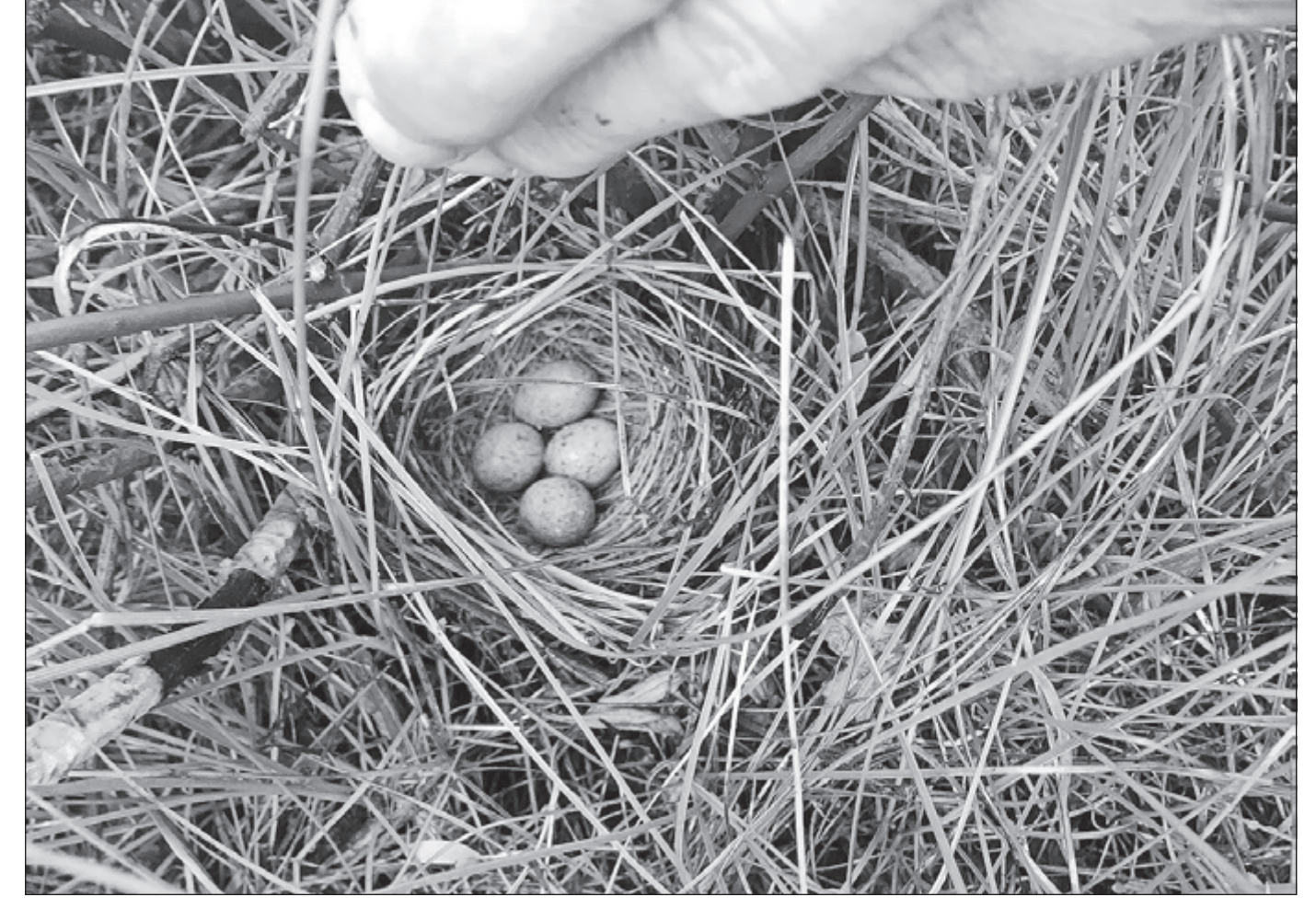
The saltmarsh sparrow has carved out a niche over thousands of years, building grassy nests on the ground in the upper reaches of salt marshes, above the high-tide line. To live in this regularly flooded habitat, it must synchronize its breeding between the extreme tides pulled in by the new moon.

If an unusually high tide washes in and floods the nest in the first few days, the eggs are dense enough to remain in place. But they lose density and gain buoyancy as the days go on, and if the nest floods later, the eggs will float. If the female has built a good nest with high walls or a protective canopy, the eggs won't go anywhere. But if the eggs float out of the nest, the sparrow has no way of getting them back. When the chicks hatch, the race against time intensifies. The chicks cannot swim or fly. To survive, they must be able to climb up the nearby grass. But it takes seven or eight days until their legs are strong enough. And on each successive day, the tide creeps closer. "That's how tight it is," Reinert says. "This is the story that plays over and over again for the saltmarsh sparrow."