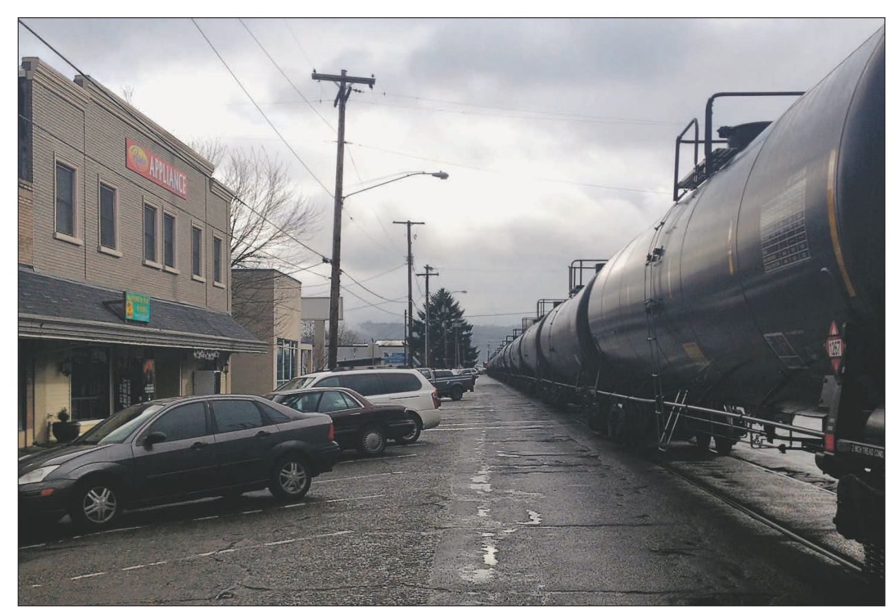
Railroads, insisting where and when oil is transported is "sensitive security information," continue to move oil trains through towns such as Rainier unannounced. However, the U.S. Department of Transportation says oil is not a sensitive security commodity.