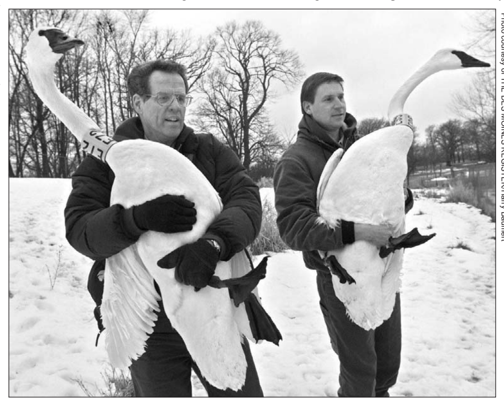
Iowa's Department of Natural Resources is known for its fish and wildlife duties, such as attending to these trumpeter swans. But the agency lacks staff and funding to fulfill its full environment-protecting mission.

A reporting key was sitting down with the department's budget director. I went through the entire operation, line item by