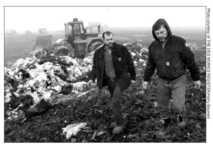
A landfill worker and Iowa state inspector walk through a landfil near Eldora, Iowa. The Iowa Department of Natural Resources lacks the money and staff to perform all of its environmental inspections.

I did have training in this area. I have a minor in environmen-