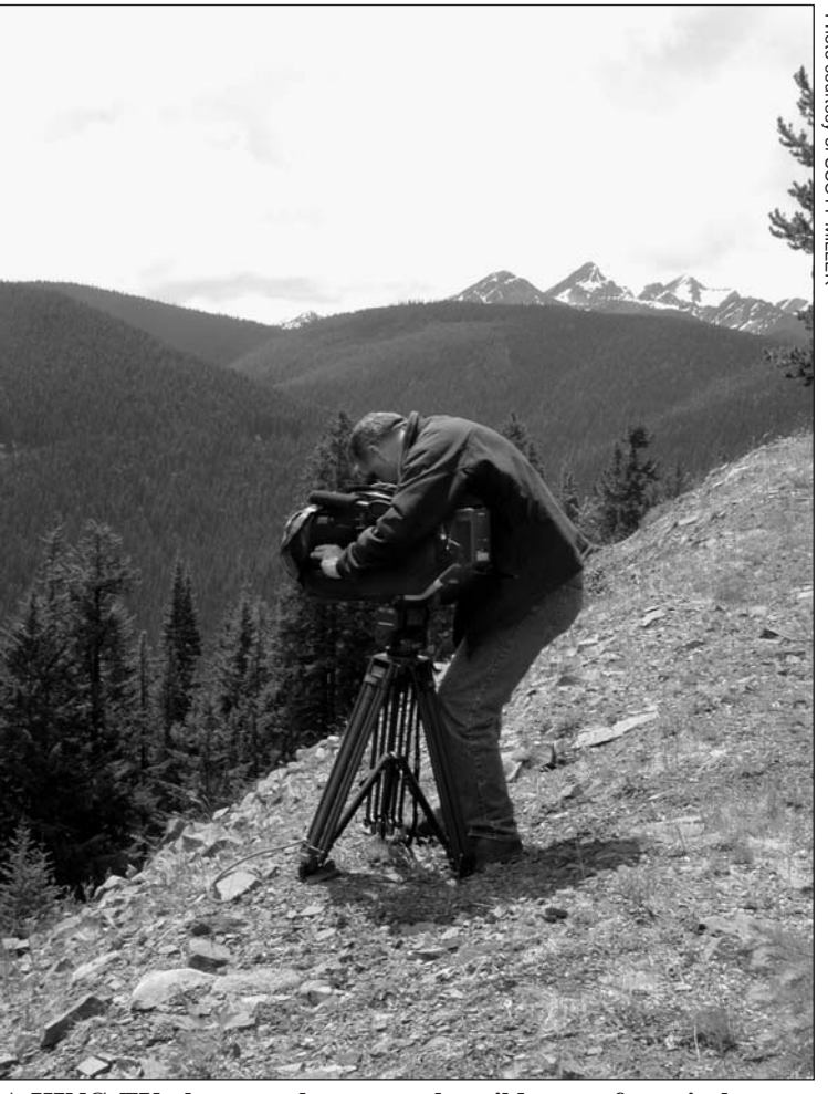
A KING-TV photographer scans the wilderness for grizzly bears in British Columbia's Manning Provincial Park. Large carnivores always make the air.

The sound of success: Audio is the most overlooked asset in a television story. It adds critical texture and pacing to a story that help draw viewers in. When you are shooting a story, don't just look. Listen.