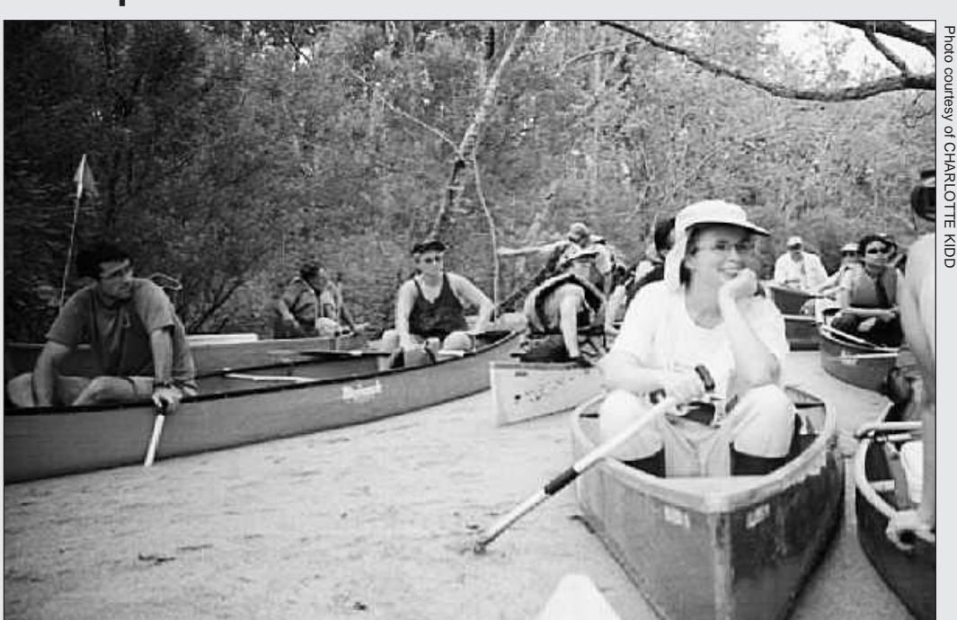
Thursday field trips during SEJ's 2003 annual conference in New Orleans took some intrepid souls on a tour of Bayou Trepagnier and LaBranche Wetlands.