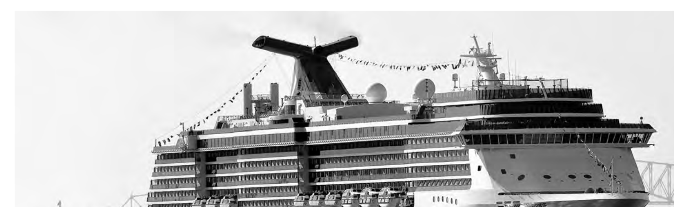
Carnival Cruise Lines has threatened to pull its business from Baltimore over a pending air-quality regulation that would require ships such as the Carnival Pride to burn cleaner fuel. The EPA estimated that burning cleaner fuel would add $7 per day, on average, to individual cruise fares.

limit took effect, several cruise and shipping lines complained of being unable to find enough fuel. They told officials they were paying 15 percent to 40 percent more. With a tighter standard looming in 2015, some industry officials have warned of sharply higher prices and cutbacks in U.S. cruises.