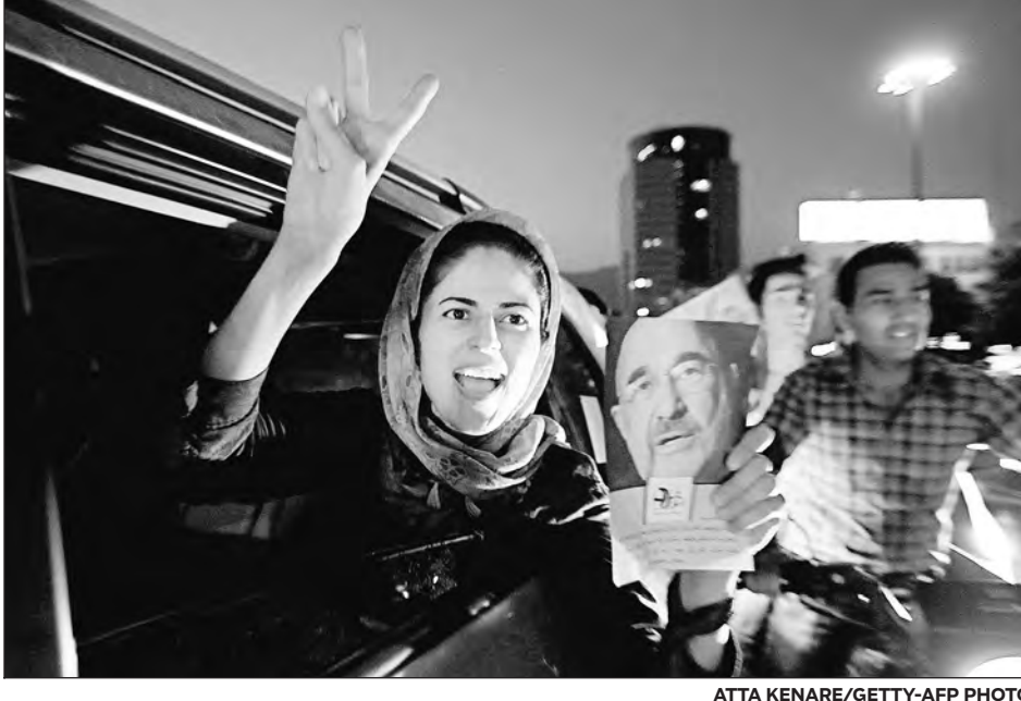
A woman holds a poster of winning presidential hopeful Hasan Rowhani as Iranians celebrate Saturday in Tehran's Vanak Square. In a field of eight, he won 50.7 percent of votes.

sured and often nonspecific, clearly designed not to confront the leadership. Rowhani's economic prescriptions - create jobs by bolstering domestic industry and attracting foreign investment - weren't especially original. But he linked economic development with an ambitious, albeit somewhat inchoate, project for "reconciliation with the world," hinting at a global