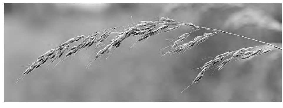
Native Americans set fire to the grass to flush game in the once largely treeless landscape.