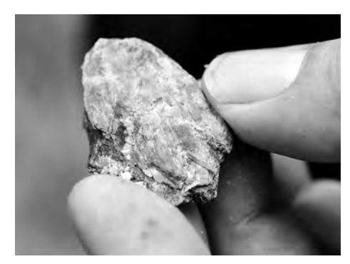
Soldiers Delight's rocky soil — with chromite, asbestos and other minerals in it — provides habitat for 40 rare plants and animals.

ardship, defended the restrictions on wildlands activities and development, but said the state would try to work with those raising questions. Addressing complaints from mountain