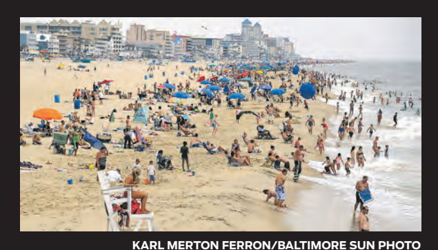
Ocean City beaches, shown in August, are swarmed by recent high school graduates in early June.