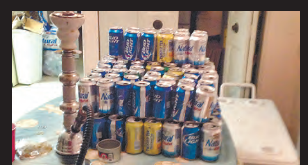
REALTOR'S PHOTO This was the scene a Realtor found in the kitchen of a rental property during Senior Week.