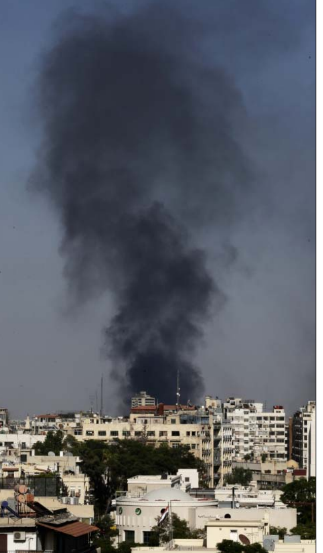
STRIFE CONTINUES: A column of smoke rises after heavy shelling in the Jobar neighborhood, east of Damascus, on Sunday.

He noted that beyond getting experts on the ground, investigators would have to collect samples from soil, ammunition fragments and even from victims. After