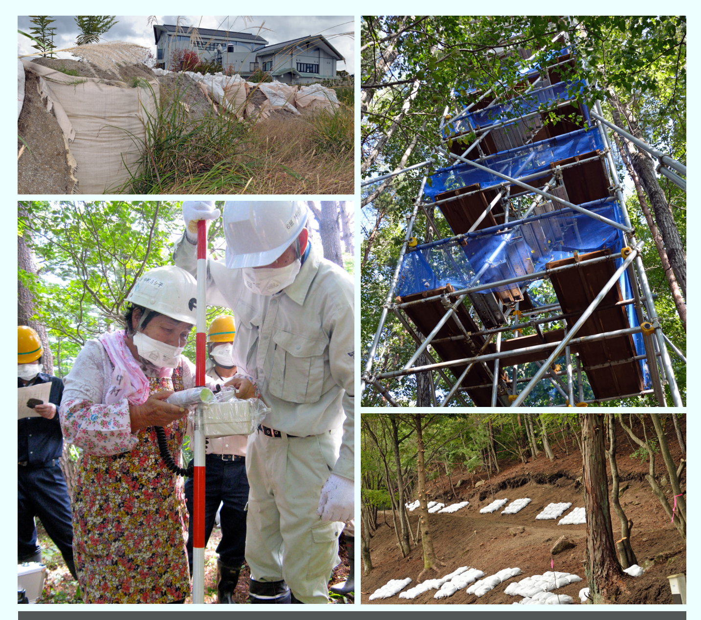
Clockwise from top left: Bags of contaminated soil from litate; a tower for monitoring movement of radionuclides in Kawamata; trial decontamination behind a home in Kawauchi; forestry and construction workers join in forest decontamination training at Forest Park Adatara, Otama.

already launched a recovery plan aimed at getting them back.<sup>23</sup>